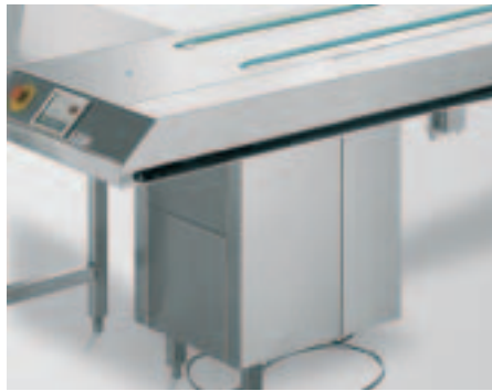
Circular belt food distribution conveyor

Belt unit, circular belt conveyor and motor station in modular design. Stainless steel housing, 2 circular belts run at a distance of 220 mm in V-shaped parallel edged slide grooves in PUR with polyester pull insert, colour green. Control at the end of the belt, switch cabinet with control/fuse box, main switch. Three phase motor, stepless adjustment from 2.5 - 10.5 m/min. Drawer with dirt scraper. Up to 12 m 1 drive unit, over 12 m, 2 drive units. On uprights, height-adjustable +/- 15 mm. Upright spacing 2 m. Functions: belt on/stop/proportional speed display, emergency STOP switch. Rated voltage 3N AC 400 V 50 Hz. From 9 m, an overdrive is integrated to ensure synchronous running of the circular belts. From 12 m, a second drive unit is required.