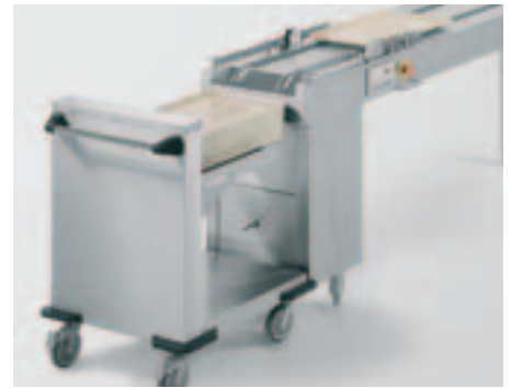
Circular belt clearing conveyor